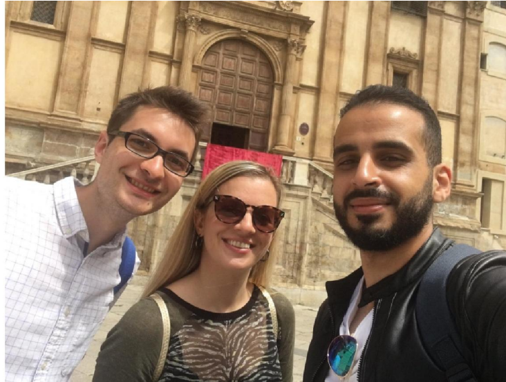
My colleague, my roommate and I on a day trip to Palermo.

This traineeship has helped me to improve my English. In addition to improving my communication skills, I have learned and used many professional terms. Although I have not had the opportunity to learn Italian so far, I can say that during this period of traineeship I was able to acquire the basics of this language, which I am extremely pleased with.