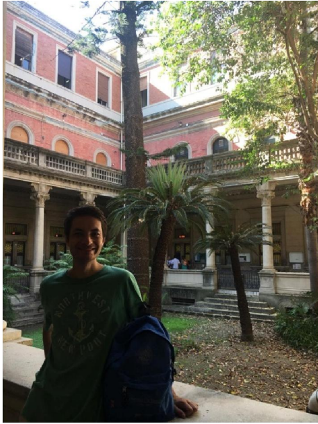
University of Messina