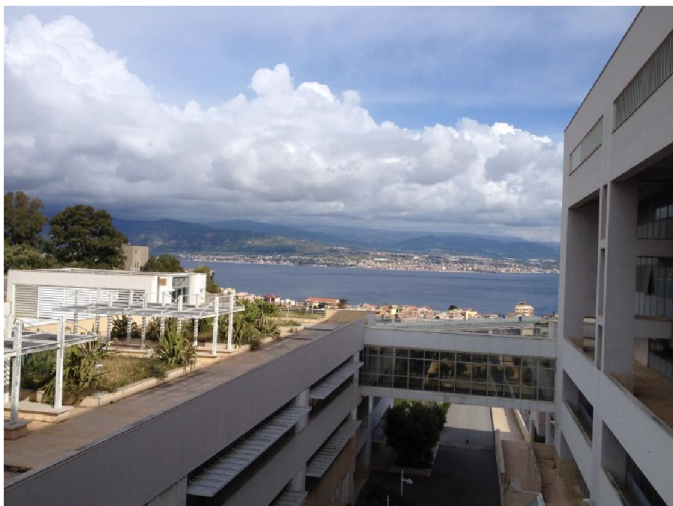
Department of Engineering – location where I was doing my research

During the Traineeship I met a lot of new people, and I am still in touch with some of them. In addition to the professors and mentors at the University of Messina, who were excellent, there is also my roommate who helped me a lot during first days of my stay, and other students I met during the traineeship.