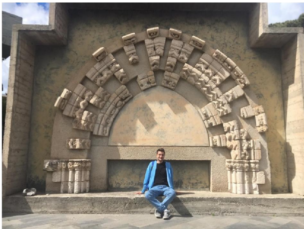
Interdisciplinary Regional Museum of Messina