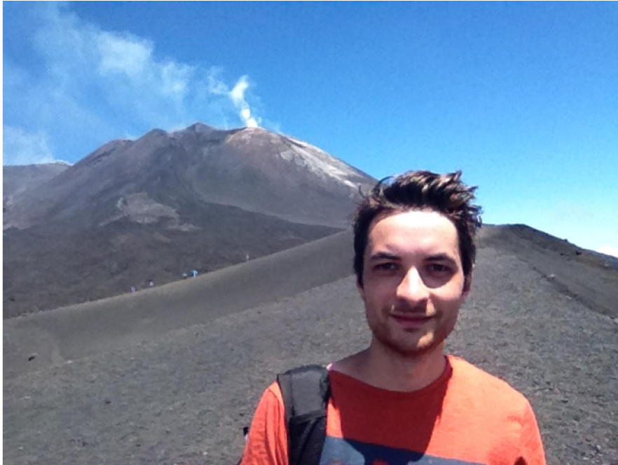
Mount Etna volcano